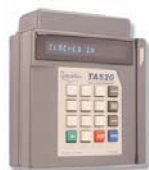
Data Collection Device