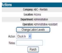
Web Entry Standard